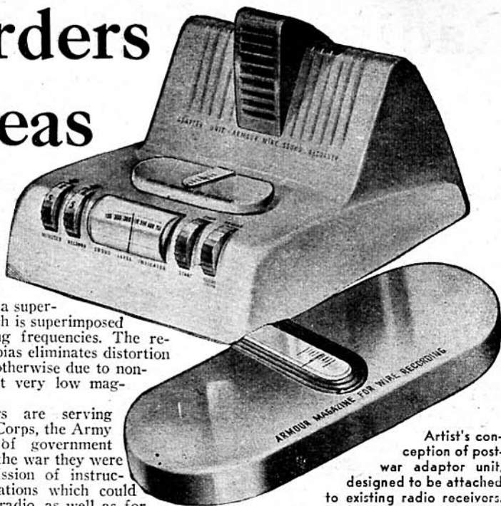
Artist's conception of post-war adaptor unit, designed to be attached to existing radio receivers.

and others pending. Evidently radio and recording will be closely linked. This is fitting, for many interesting radio programs will be recorded and stored for future playback. Since the same wire can be used