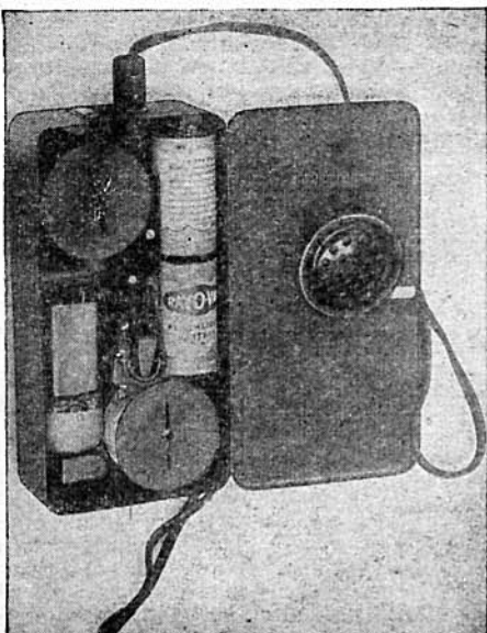
The pocket model's mechanism is very simple.

The Foundation is planning to introduce a master recorder and a multiple recorder, both now in the development stage. The first will have exceptionally high fidelity for recording professional productions. Duplicates of the master record will be made by the multiple recorder in large numbers faithfully and simultaneously for extensive consumer use and enjoyment.