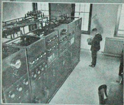
Panels at the Anoka Station