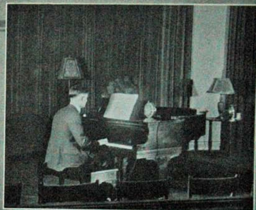
A corner of the St. Paul Studio

with glimpses of the studios in the Nicollet Hotel, Minneapolis, and the Union Station, St. Paul, and a picture of the five-thousand watt transmitting equipment at Anoka.