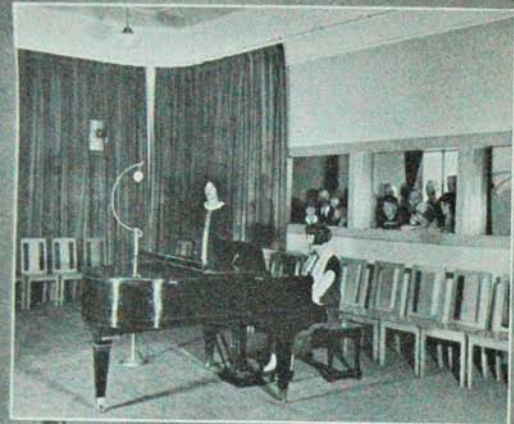
The Minneapolis Studio and Visitors' Gallery