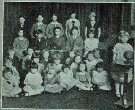
A Group of the Junior Artists