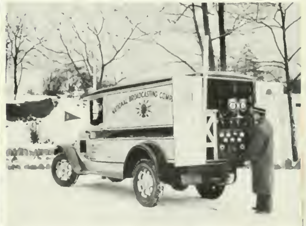
NBC's first mobile broadcast unit, which went into operation in 1929, was considered one of the engineering marvels of the age.