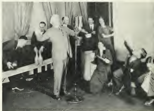
Performers in this early radio adaptation of "Rip Van Winkle" worked hard to create their own sound effects.

The network will honor its 25-year affiliated stations with plaques. Original employees of the network still on their jobs will be inducted as charter members of the NBC 25-Year Club at the Company's annual outing on August 18.