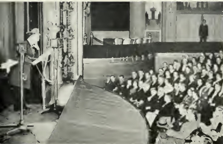
In the early Thirties, live audiences witnessed the antics of Ed Wynn, the "Texaco Chief", in NBC's Times Square Studio.