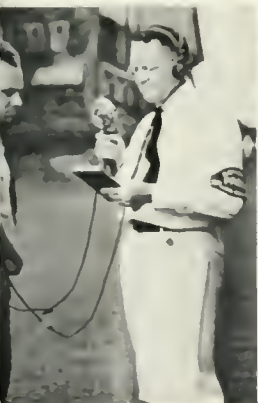
First back-pack transmitter was used in 1931 to broadcast a golf tournament.