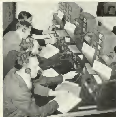
NBC newsmen tuned to world events at this short-wave listening post.