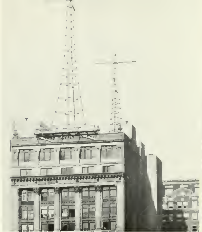
Dual antennas for stations WJZ-WJY were erected on the roof of Aelion Hall in New York City.