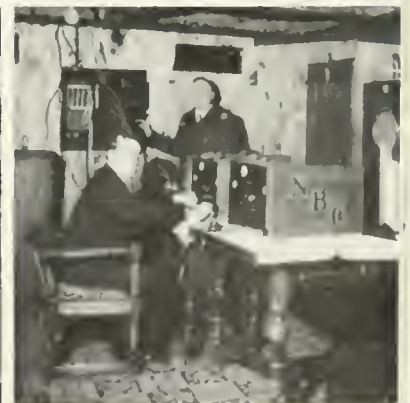
Short-wave transmitters, such as this, were used to broadcast news from remote points.