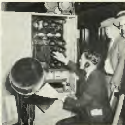
Early-model portable field equipment, including horn-type loudspeaker.