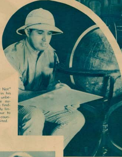
Robert L. "Believe It or Not" Ripley is still engaged in his perennial search for the unbelievable, and NBC-Blue audiences benefit from his findings. Here he is, probably lining up a new world tour to add to the almost 150 countries he has already visited.