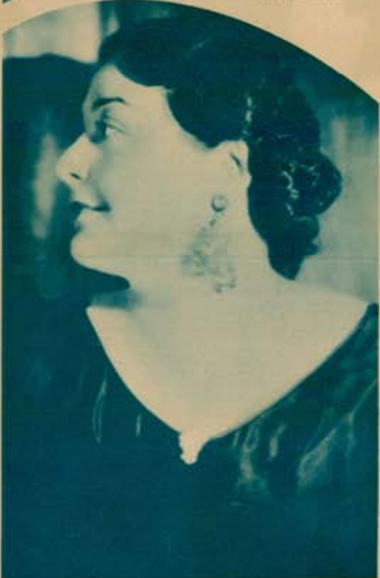
Filled with the same pep and infectious charm that made her the darling of the nation when radio was in its infancy, Vaughn de Leath celebrates her 17th anniversary on the air this year.