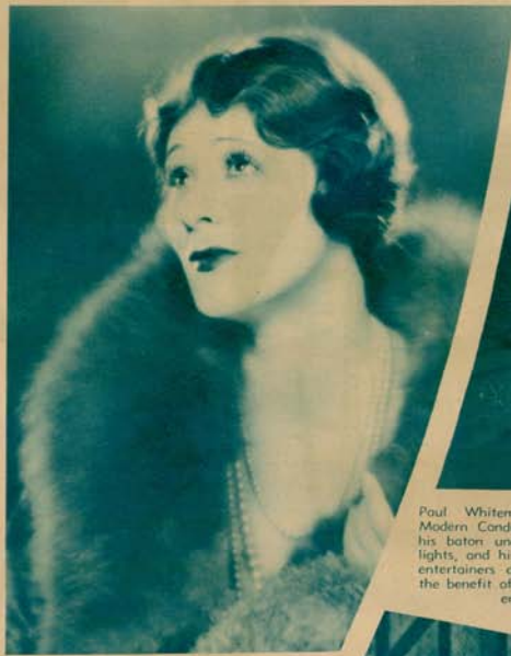
Exotic Irene Rich, riding the crest of nation-wide popularity, is another outstanding personality appearing regularly on NBC-Blue programs.