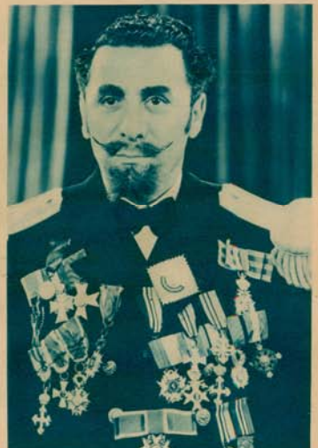
Looking like a medal display rack, Jack Pearl, the famous "Baron Munchausen", is all set for more tall tales for NBC-Blue listeners.