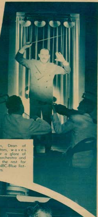
Paul Whiteman, Dean of Modern Conductors, waves his baton under a glare of lights, and his orchestra and entertainers do the rest for the benefit of NBC-Blue listeners.