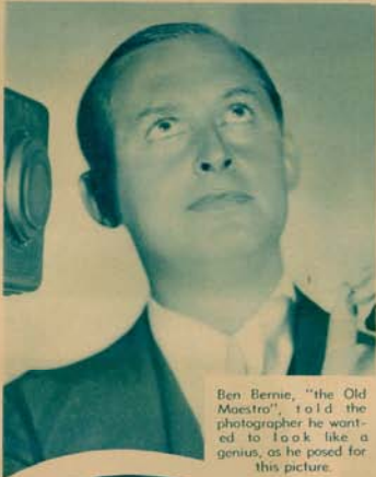
Ben Bernie, "the Old Maestro", told the photographer he wanted to look like a genius, as he posed for this picture.