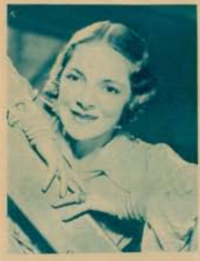
Helen Hayes, sparkling actress, pauses to pose for this shot between broadcasts on the NBC-Blue network.