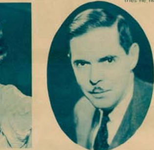
After 25 years before the footlights, Harvey Hays stepped before the microphone and now entertains NBC-Blue audiences with plays and verse.