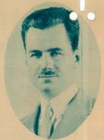
Author, world traveler and radio reporter Lowell Thomas, sums up the important news of the day to keep NBC-Blue audiences in close touch with what's what everywhere.