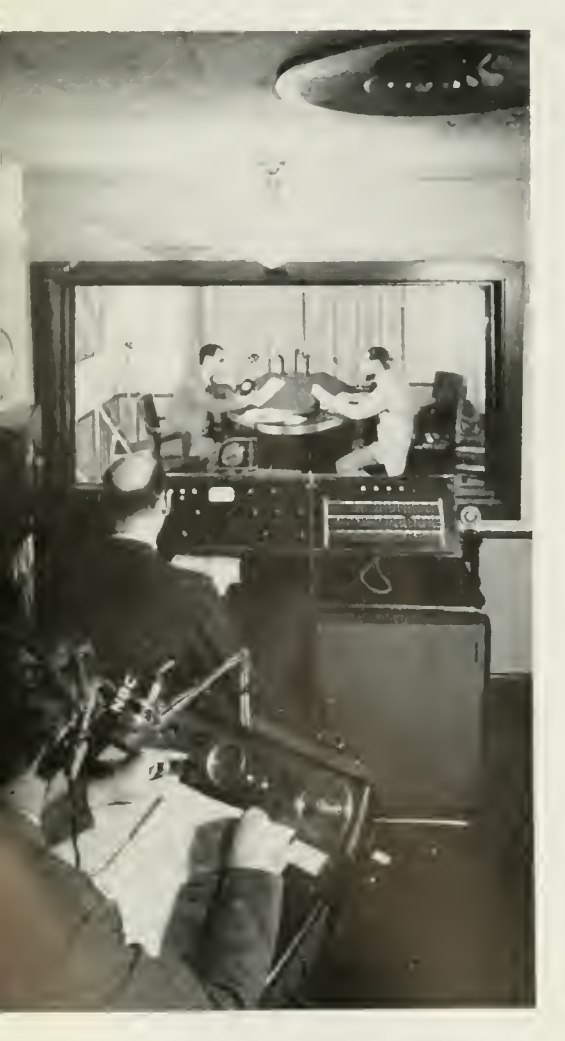
CONTROL ROOM ENGINEERS (FORLGROUND) PUT NBC NEWS COMMENTATORS ON THE AIR AT RADIO CITY,