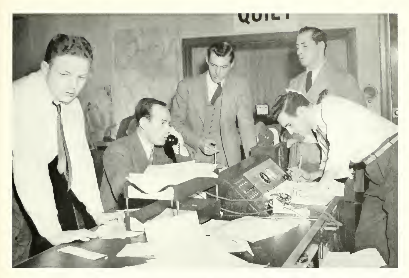
IN TIME OF WAR, THE COPY DESK IN THE NEWS ROOM, RADIO CITY, NEW YORK, IS A SCENE OF MUCH ACTIVITY. LATEST NEWS REPORTS FROM ALL OVER THE WORLD ARE RECEIVED HERE AND PREPARED FOR BROADCASTING.

work, American listeners were fully and realistically informed of the tragedy that impended.