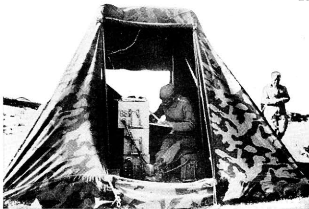
A radio operator at work in a field station.

The author, recently returned from war-torn Spain, tells graphically of the use of radio in many war and propaganda activities there.