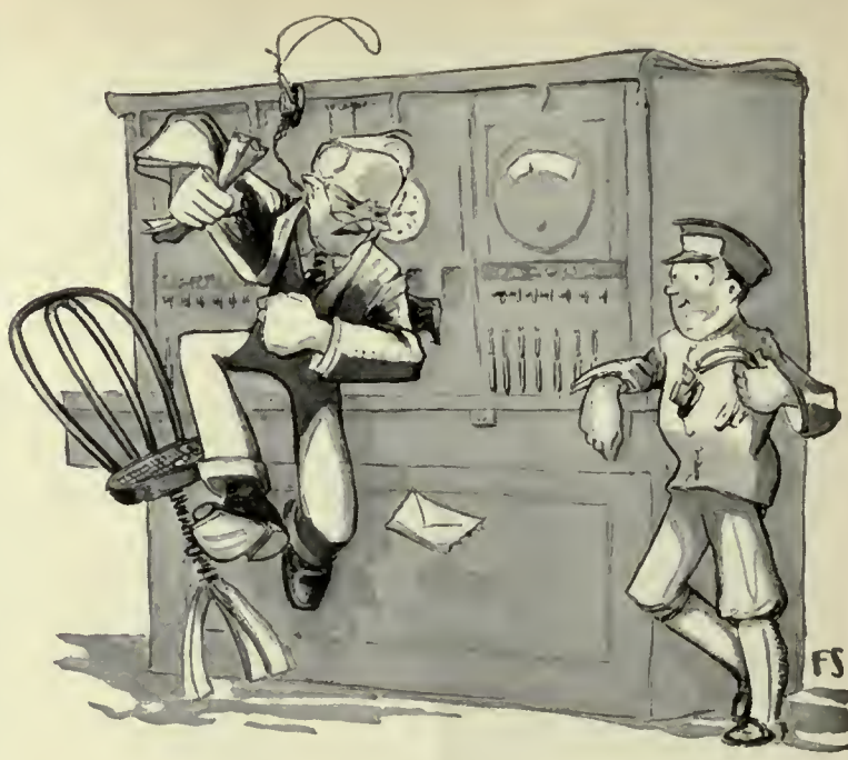
"THE WIRE CHIEF WENT UP IN THE AIR"

OMEWHERE in his writings or conversations Anatole France compares a synthetic language to a doll, while a natural language, with its centuries of use, growth, and development, he likens to a living woman. On a more modest scale, the technical terminology of an art or science, as it reflects the achievements and changes of years of effort on the part of many men, takes on an almost organic meaning and color. We usually think of objects like antennas and microphones as purely inanimate and lifeless, forgetting that they are the tools of human aspirations and carry with them an emanation of human emotions. The names of these tools, and of the scientific ideas which they em-