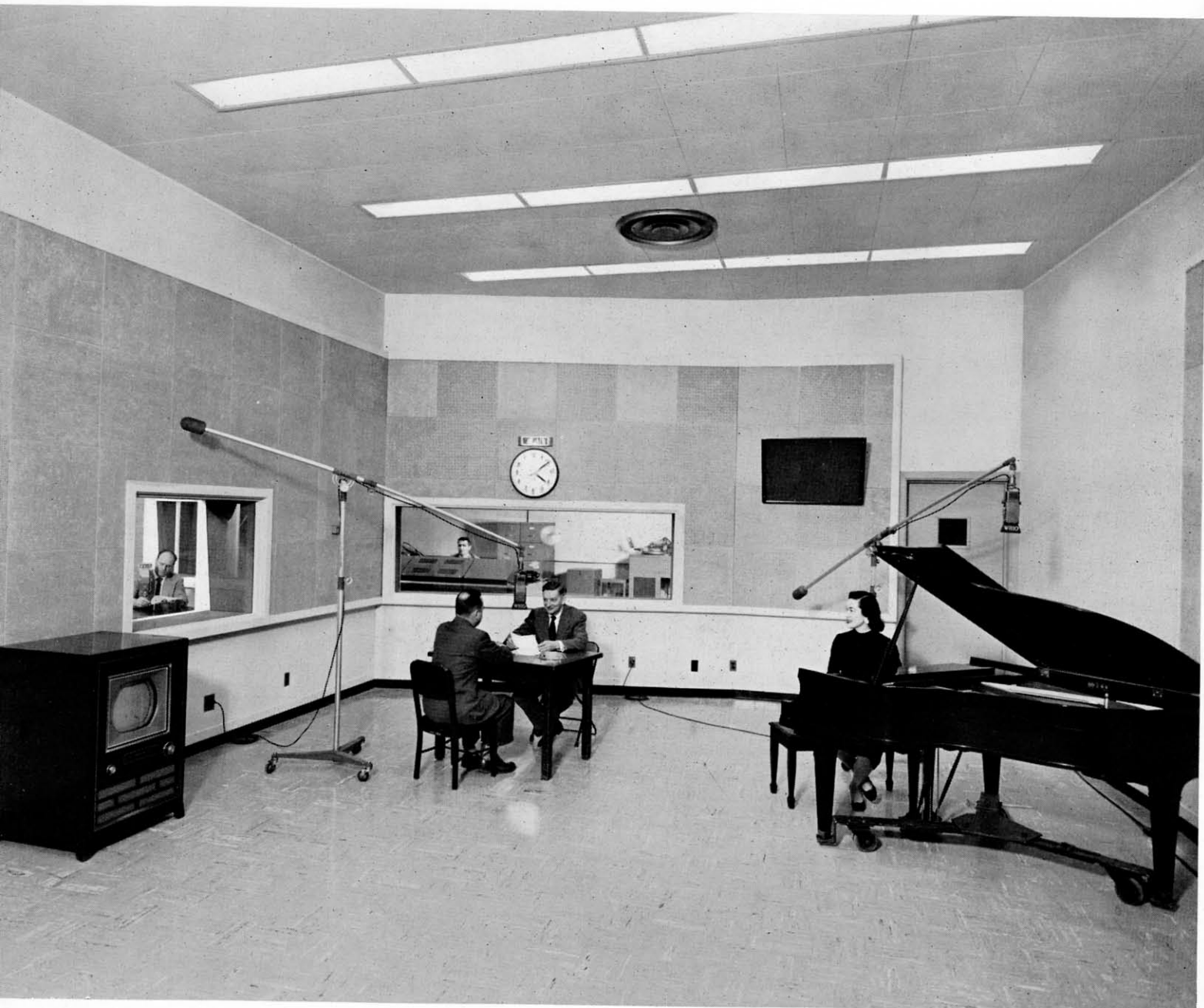
FIG. 13. WHIO's main AM studio. Walls are covered by perforated asbestos board which covers acoustical materials of various densities chosen to provide an ideal frequency curve. Smaller AM studio can be seen through window at left and AM control room through window at rear.