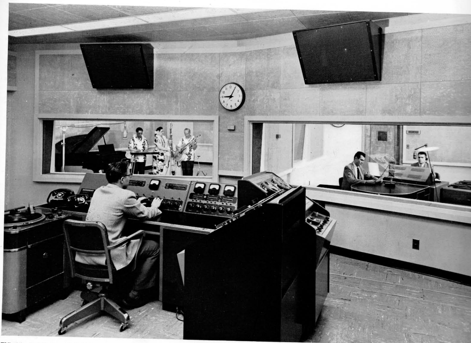
FIG. 14. AM Master Control Room in new WHIO Studio Building. The three AM studios are grouped about this control room so that there is direct visual communication between all three and the control room. An RCA BC-2B Console and RCA BCS-11A Switcher provide flexible facilities with a high degree of operating efficiency.