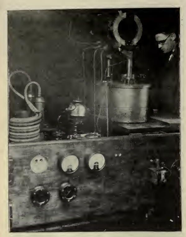
THE 94 METER TRANSMITTER In use at KDKA to send programs to Hastings, Nebraska. The transmitter is supported on heavy springs so local jars will not change the wavelength adjustment

sists of three panels: the rectifier panel, the modulator panel, and the oscillator panel. The rectifier converts the high voltage A. C. current, obtained by stepping up the ordinary plant current supply to high voltage D. C. for the plate circuit. The modulator with its accessories impresses the voice frequency on his high voltage D.C. current before it goes to the oscillator. Finally the oscillator converts the high voltage D.C. currents into radio frequency, in which form it is delivered to the antenna.