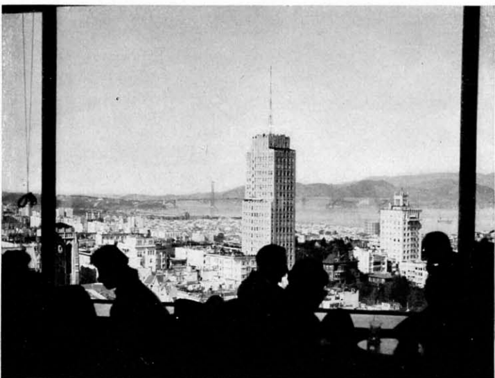
The Top of the Mark, famed vantage point overlooking San Francisco, gives view of KJBS-FM's antenna with background of Bay, Pacific Ocean, Golden Gate Bridge.