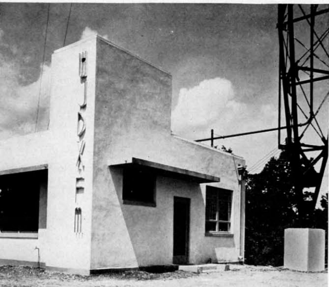
New transmitter building five miles from city houses 10 kw FM transmitter for WJDX-FM, with base of antenna tower visible at right.