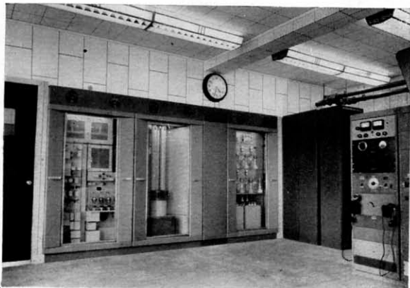
New operating room at KWK-FM for W.E. 10 kw FM transmitter.