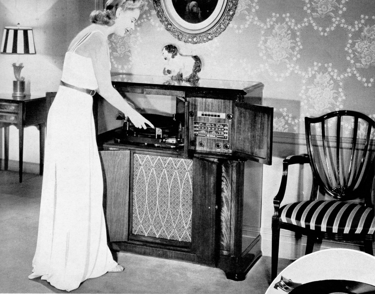
The RCA V-225 with automatic record changer.