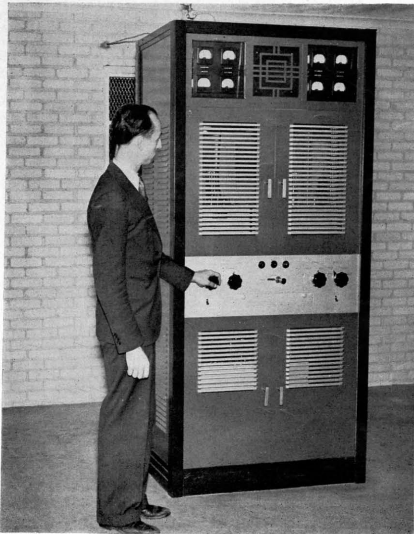
The new ET-4250 at WTRC ready for operation.