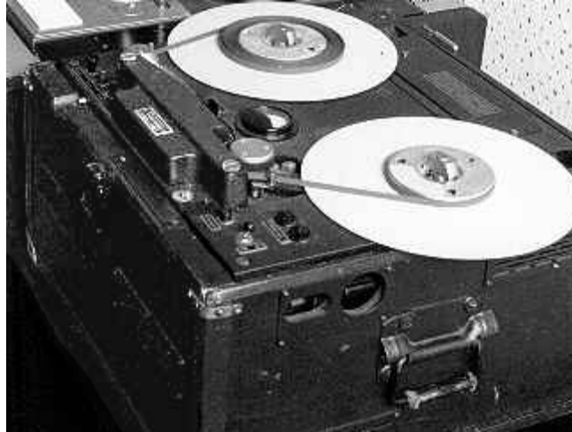
Original Magnetophone brought out of Germany, c.1945

During the war there were numerous articles about the Magnetophon in the German magazine Rundfunk , and I have photocopies of the articles from the Library of Congress. Pictures, diagrams, descriptions, and explanations of its use were all published in the magazine that was the Radio Guide for Germany. That is really keeping it secret, isn't it!!