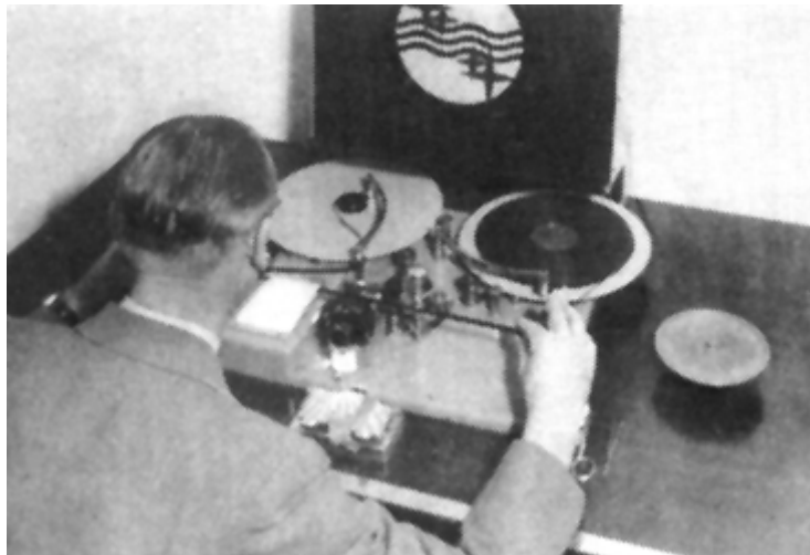
A Philips Miller 1 'Tape' Recorder

There are MANY other ways of making recordings that have been utilized over the years. Grooves were embossed in all sorts of plastic discs and films, and in one case, the Philips-Miller (Philips Mueller) machine utilised an optical recording system similar to motion picture film