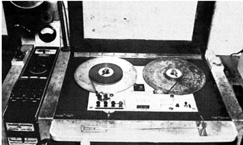
Original Magnetophone brought out of Germany, c.1945