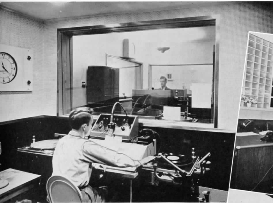
▲ Studio "D"—A Transcription Studio at the Asheville Station.