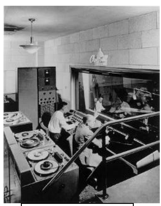
Capitol Studios c/w Ampex