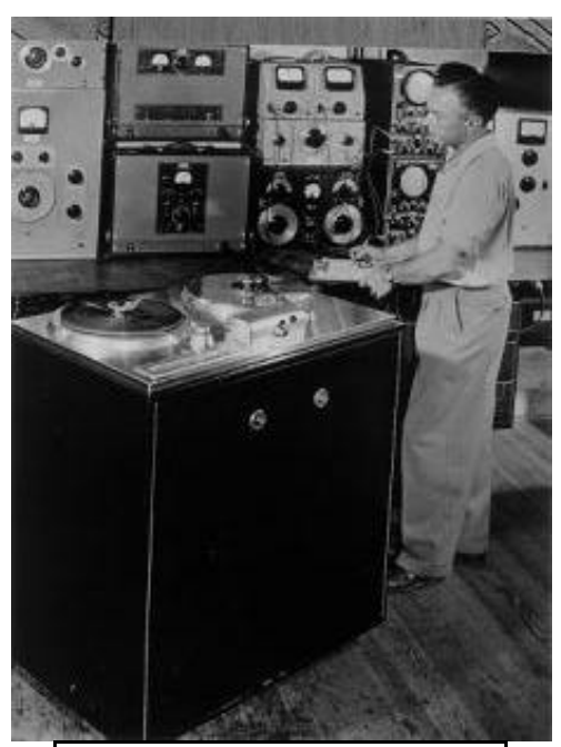
Ampex Consul Model 200 S/No 1

Much of what we did-things like making up a song out of several takes, "inventing" canned laughter, tight editing to take out offending material has become commonplace. But I had to learn for myself. It was part of a process of discovery sometimes serendipitous that began at that fork in the road outside Frankfurt. Sometimes I wonder what would have happened had I turned toward Paris. Perhaps, for the tape recorder, the story would have had much the same outcome; for me it would have been quite different.